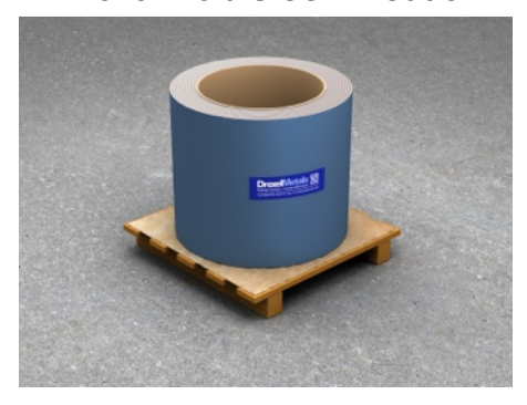
Drexel Metals Flat Sheet